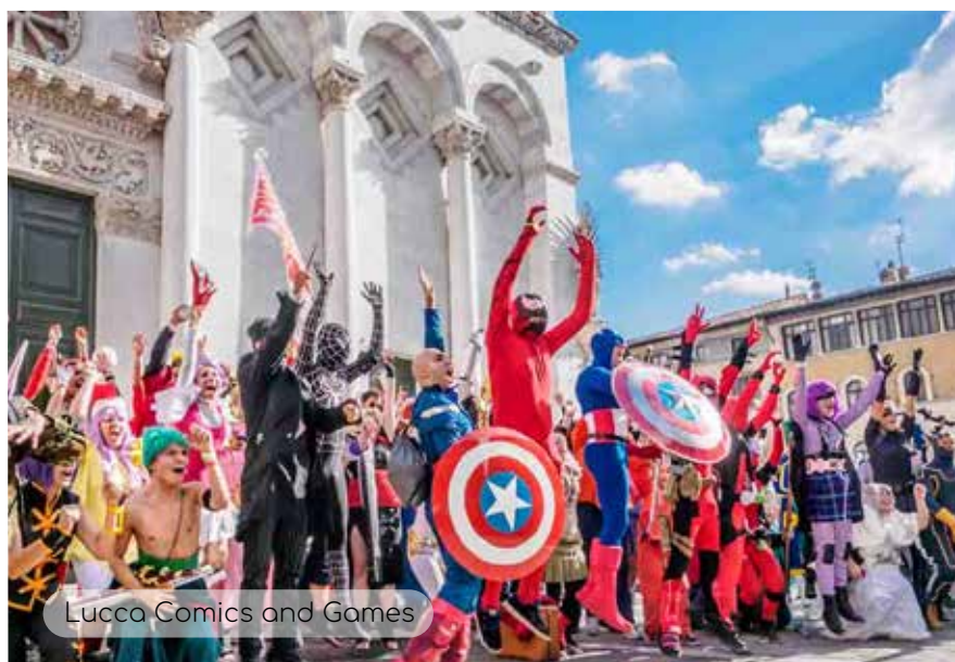
Lucca Comics and Games

Traditional wagon sfile and entertainment for children and adults